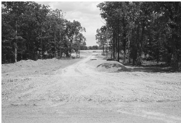
Entrance to the drag strip.

Each person entering into the track will receive a Get Out of Hell Free Card with the Romans Road on the back of it along with a salvation prayer.