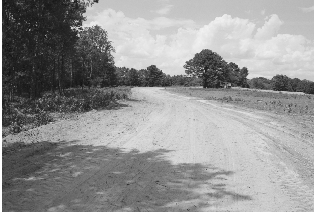
The road to the concession stand. The concession will be built under the large tree with an adjoining picnic area.

We found a wonderful Christian attorney in Little Rock who had already dealt with this very law. He reviewed everything and felt also that since we were exempt from the very first clause of the law, we were then exempt from the whole law. The EPA agreed with us, so we were free to resume construction of the track. How-