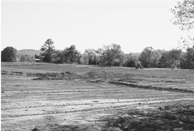
A view of the drag strip. We'll be putting down black top in two weeks.