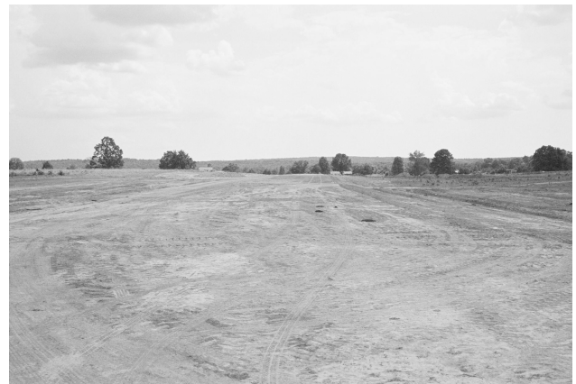
Looking down the length of the drag strip.

The Lord has shown us that we must reap in fields that are "white for the harvest." Some fields are not ready to harvest. A major problem in evangelism is finding something to attract the un-churched to a place where they can hear the gospel. Also many people cannot effectively reap because they have nothing in common with the "wheat" and thus have great difficulty talking with them. Recent surveys have shown that 78% and more, of the general population is enthused about racing and various forms of motor sports. The wonderful thing about this "field" is that it goes across all cultural lines. I, Rebecca was amazed recently while ministering in Puerto Rico to find that one of the pastors of the church was totally enthused about racing. In fact, he works in the area of television and is responsible for televising all the NASCAR races when they come to San Juan. Every where I travel, as I share about this project, I find that a large portion of the audience has been into drag racing at some point or other in their lives.